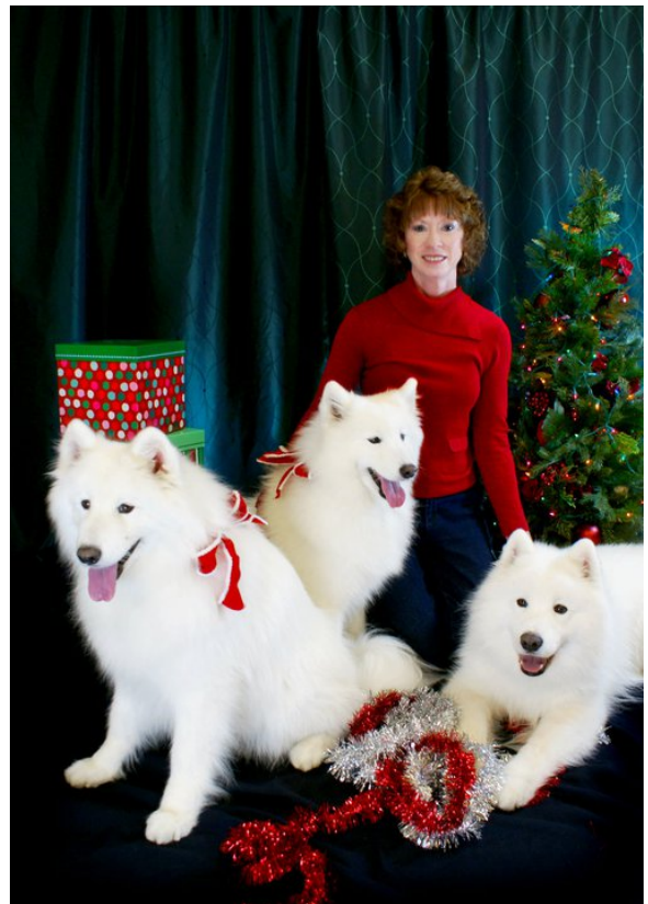
Wishing everyone a Happy Holiday season and the very best in 2011